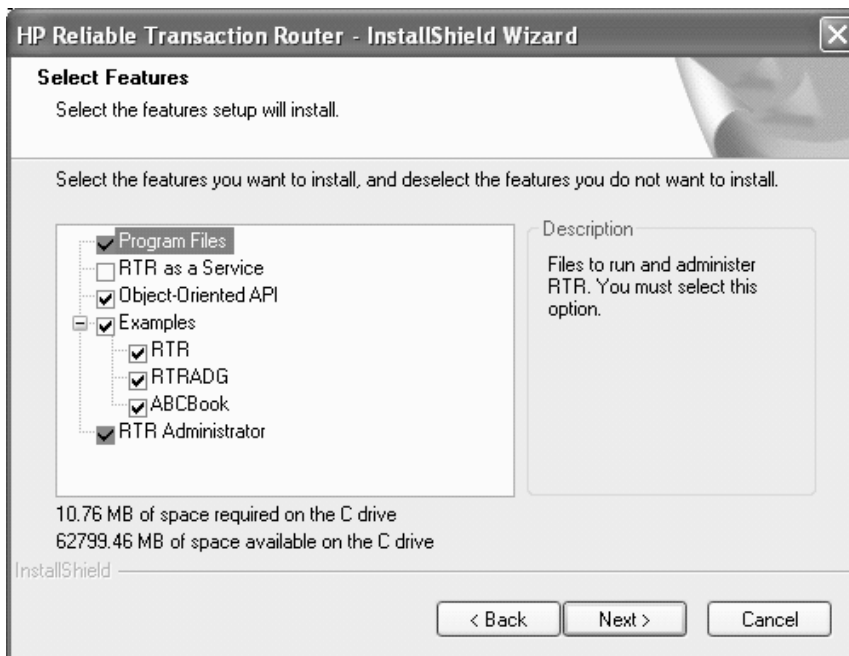
Figure 5–2 Select Features Screen