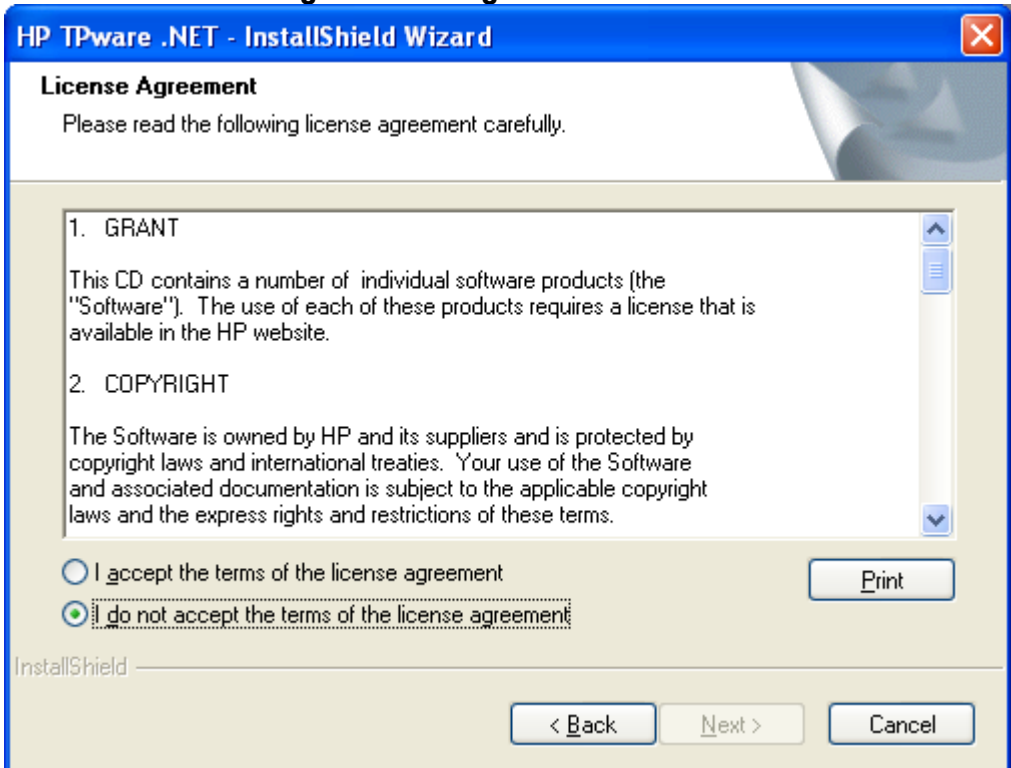
Fig 2: License Agreement

2. Click Next. The License Agreement screen is displayed.